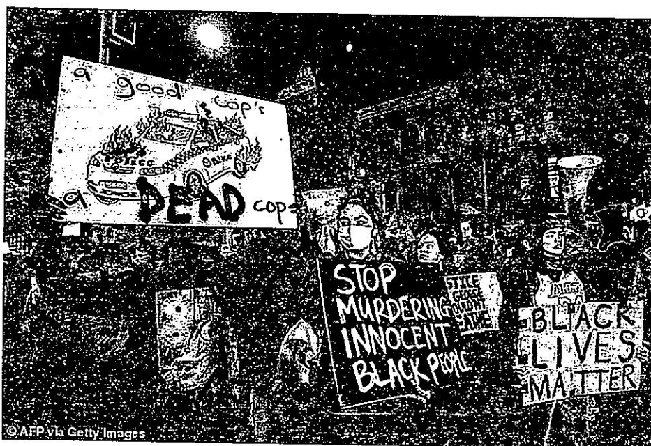
Protesters hold up placards during a rally for justice in Sydney on June 2, 2020, against the deaths of members of the Aboriginal community in Australia

Ms Price said Aboriginal people are the most incarcerated people in the world - because of violent crimes and that if people were serious about protecting Aboriginal lives then they would focus on lowering the rate of family violence in indigenous communities.