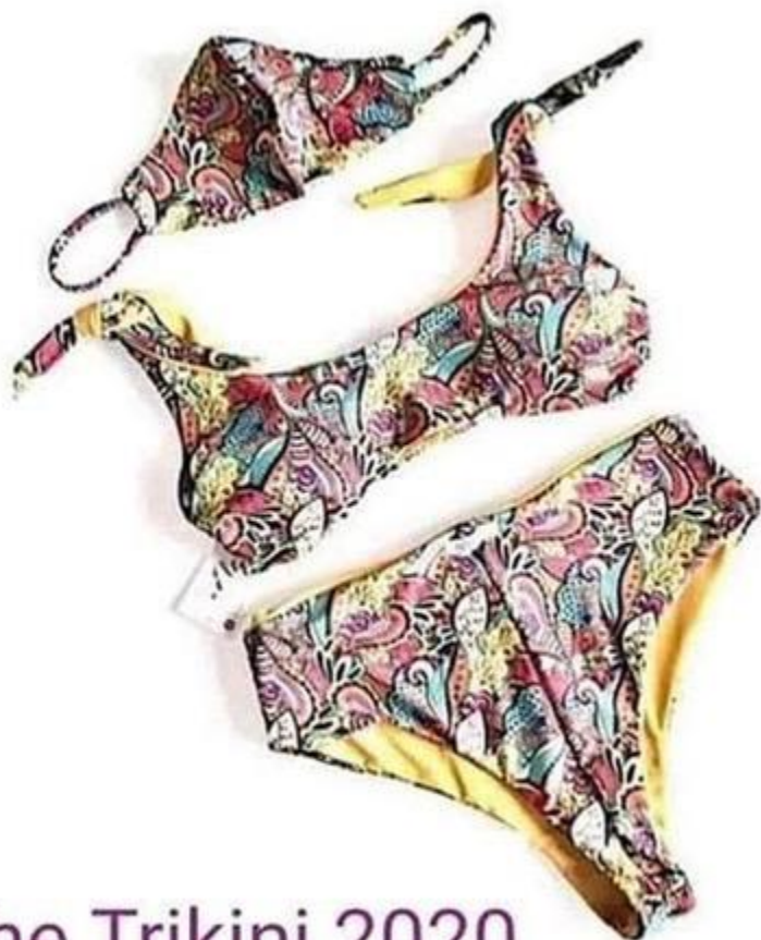
The Trikini 2020