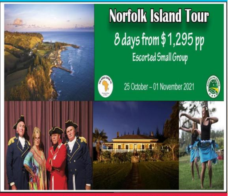
All prices of the tours will be based on 10 or more travelling together. Contact Lalani for all tour details and pricing

2017 – helloworld Gold & Silver High Sales Achievement Award in Queensland 2016 & 2018 – Winner of Trafalgar Tours Champion Agency in Queensland 2016 – Best 10 Offices in Australia for Premium - Luxury – Insight Journey Tours