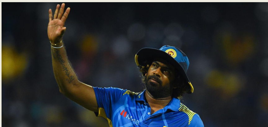
File image of Lasith Malinga

Malinga, who retired from Tests in 2011, from ODIs in 2019, and from franchise cricket in January, announced