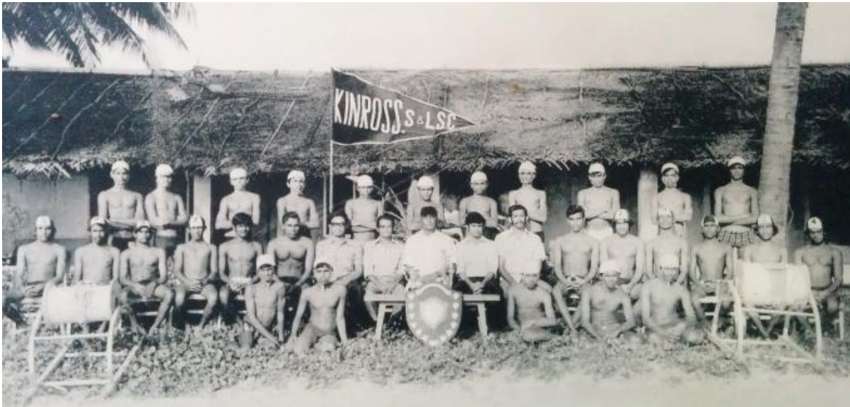
Kinross Club Members in front of the cadjan-roofed clubhouse in the mid-1970s