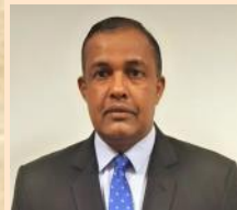
Dharmapala Weerakkody Acting High Commissioner for Sri Lanka in Australia