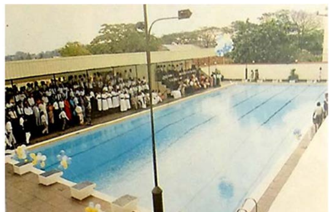
Opening of the Swimming Pool - January 1991