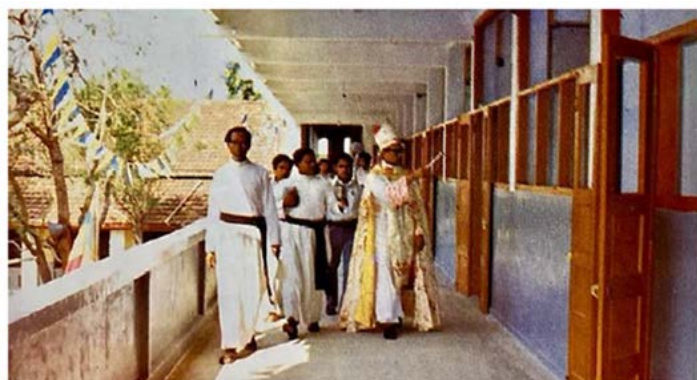
The Three storey Science Laboratory and 18 classrooms - March 1981

Appointed the eighth Rector of St. Peter's on 9th January 1978, he was faced with the herculean task of rebuilding the school which had been battered and bruised by the impact of the Schools Takeover Act of 1960. He took immediate action to improve the standard of studies which reversed the exodus of students. He implemented change in the school administration by establishing a board of management consisting of senior lay teachers to whom he devolved the responsibility for discipline and studies which was traditionally held by the clergy.