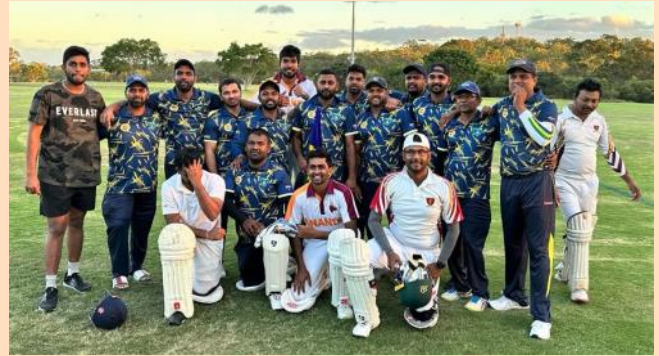
The Winning Team: Sri Sumangala College

Sri Sumangala was declared as winners for the school trophy for the 3rd time.