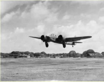
A Bristol Blenheim Mark IV of No. 11 Squadron RAF, takes off from Racecourse airfield, Colombo, Ceylon.