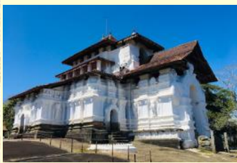
Sri Lankaramaya in Daulagala

As usual, the name is linked to the time of the Kings ruled the country from Kandy. It was a time where people walked on foot paths to places. The administration of the country was through people appointed by the King.