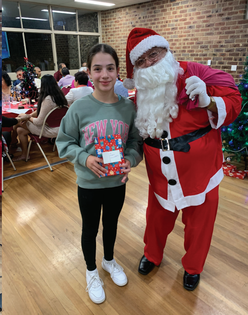
The kids were all smiles when receiving their gifts from Santa