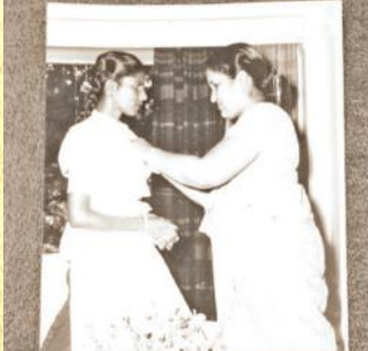
වීර පදක්කම පැළඳවීම

අප වාසය කරණ පෘතුවි වායුගෝලය පසුකරමින්, ඉන් ඔබ්බට ගමන් කරමින්, අභ්‍යවකාශයට පිවිසි ප්‍රථම මානවයා වීමේ ගෞරවය ලද යුරි ඇලෙක්සේවි ගගාරින් (Yuri Alekseyevich Gagarin), අභ්‍යවකාශ තරණයේ සුවිශේෂී වීර වර්තයකි. වර්ෂ 1960 අප්‍රේල් 12 වැනිදා වොස්ටෝක් (Vostok) යානාවෙන් අභ්‍යවකාශය වෙත පියනැඟු රුසියානු ජාතික ගගාරින්, එවැනි දස්කමක් කල පළමුවැනියා බවට පත්වී, නැවතත් නිරූපදිව පෘතුවියට ළඟාවීමේ වීර ක්‍රියාව, මානව අභ්‍යවකාශ තරණයේ සහ නවීන විද්‍යාවේ නව පරිච්ඡේදයක ඇරඹුම විය.