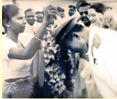
යුරි ගගාරින් පිළිගැනීම

'ජනතා' පුවත් පතේ මුල් පුවත ලෙස ප්‍රකාශයට පත්කරන ලදී. මෙම ප්‍රවෘත්තිය පළවීමත් සමඟ මේ ගැන රටවිම අවධානය යොමු විය. පුවත්පත ඇය හඳුන්වා තිබුණේ 'වීර මැගිලින්' ලෙසිනි. ඒ අනුව, ඇයට වීර පදක්කමක් ලබාදීමට වගේම ඇයගේ එම වීර ක්‍රියාව අගයන්නට එවකට අගමැතිනිය වූ සිරිමාවෝ බණ්ඩාරනායක මැතිණිය ප්‍රමුඛ රජය තීරණය කළාය.