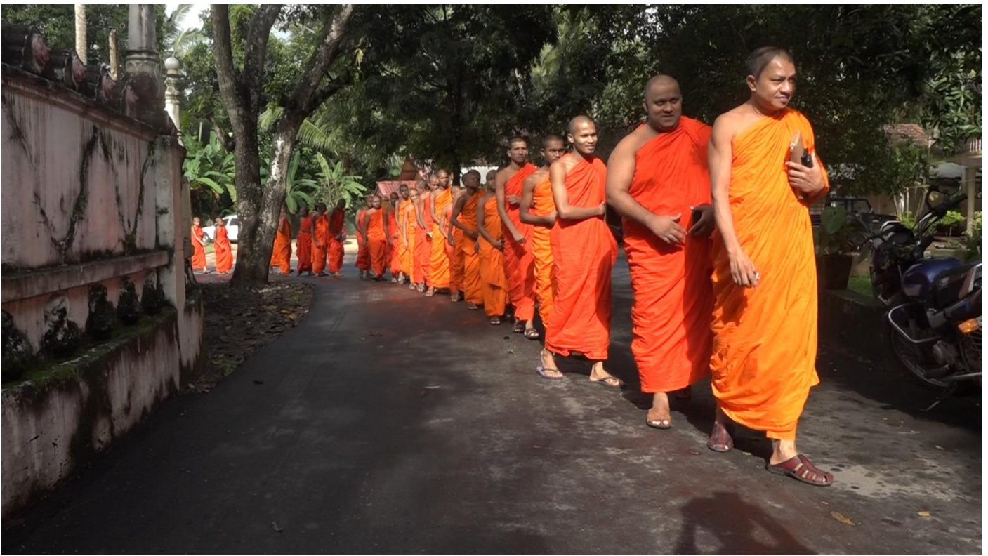
Monks from Monaragala Weliyaya Sri Piyaratana and Kerala Sri Wijewardena Pirivena walking over to the Meeting Hall