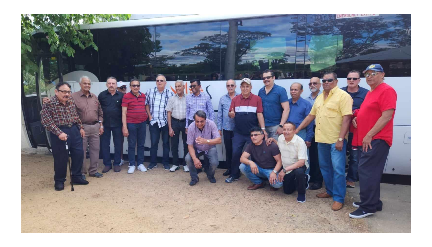
THE ACF WECOMES THE FOLLOWING NEW MEMBERS: