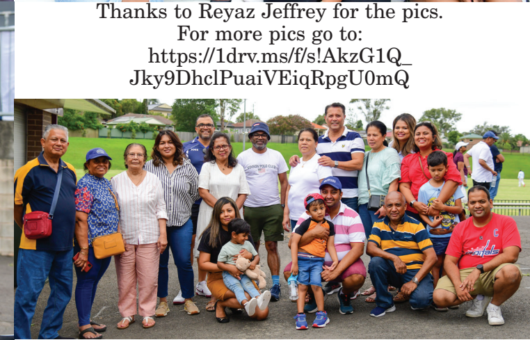
For more pics go to: https://1drv.ms/f/s!AkzG1Q_Jky9DhclPuaiVEiqRpgU0mQ