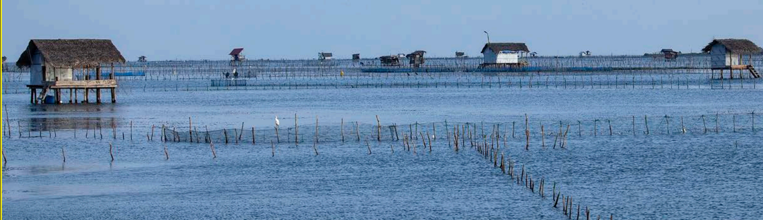
Above: Lucrative Sea Cucumber fish 'farms'. The huts on stilts are also used to watch over the product below.