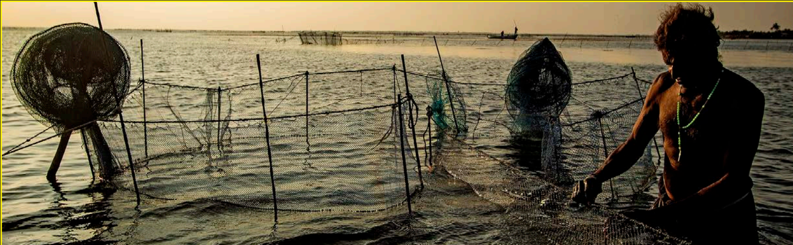
Kayts causeway. A fisherman sets his nets and prawn traps for the night. His partner will harvest the catch the next morning, roll up the traps and hang them up on the fence (as seen above) for the evening work. Below left: The old style wicker prawn trap, the man is using the newer model nylon traps. Note the rosary beads hanging off his neck - he is most likely a Catholic.