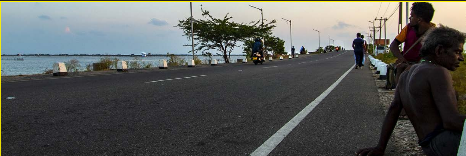
The causeway is also popular for evening walkers. Below left: A safety hung off the vehicle for a safe journey. Used charms are left on a tree as a part of the devout process. The cultural arrangement (right) was laid out to greet us into a ceremony