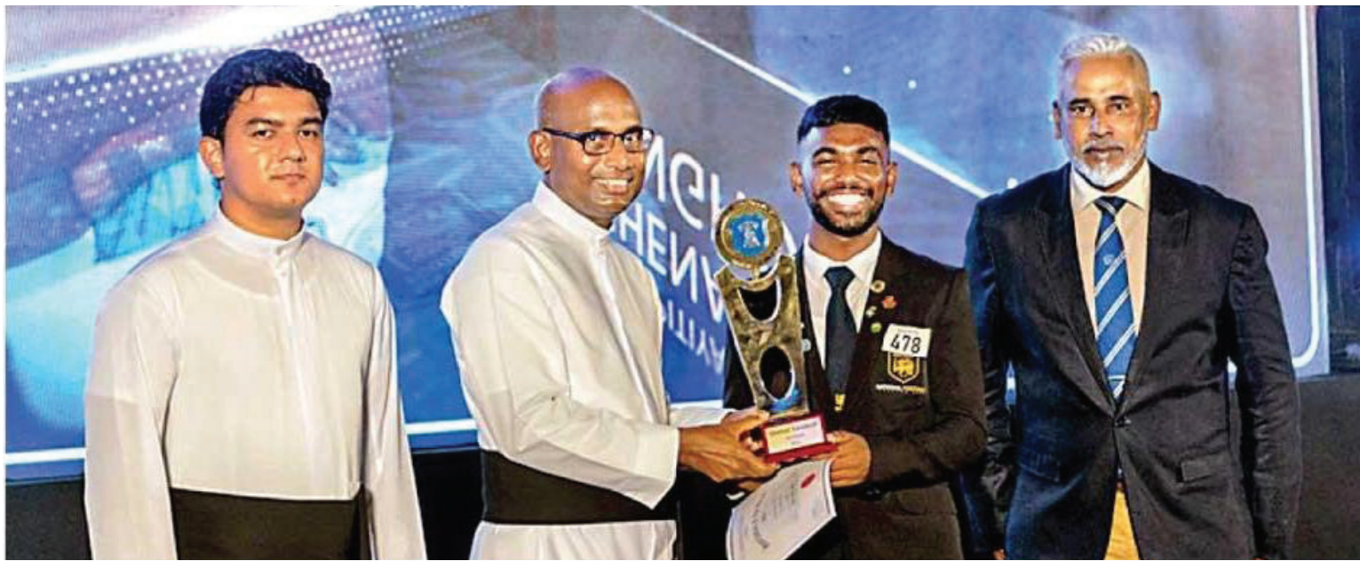
Chaminda Vaas's (on right) commitment to nurturing young talent reflects his deep passion for sports and its power to transform lives