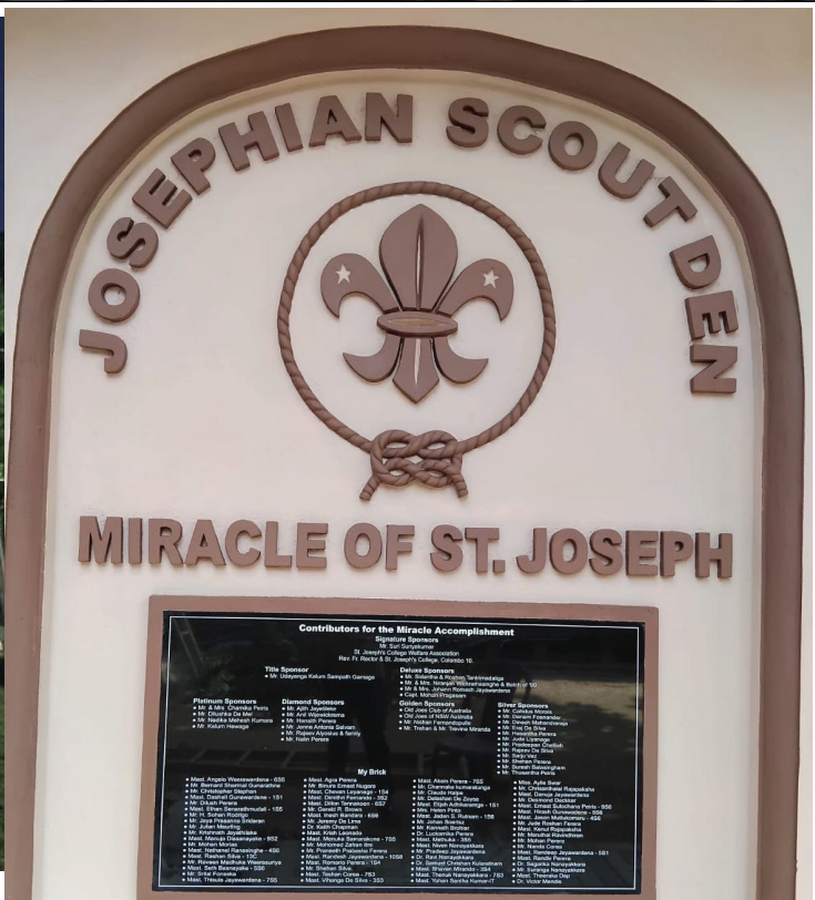
The College Scout Den was reconstructed recently with financial assistance from several sources and organisations including a gold sponsorship of the Old Josephians' Association of NSW