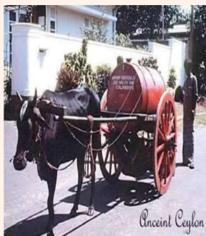
The Good ole Kerosene cart Fuel to your door