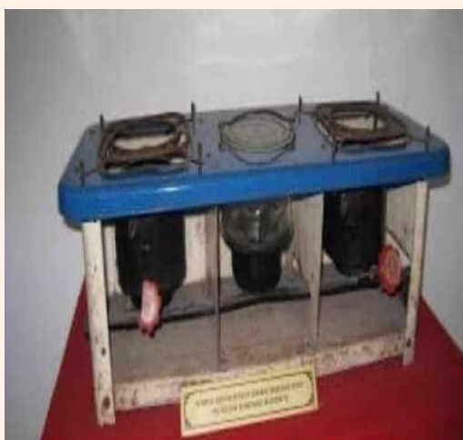
From wood fires to packed sawdust stoves the latest technology- Kerosene stoves